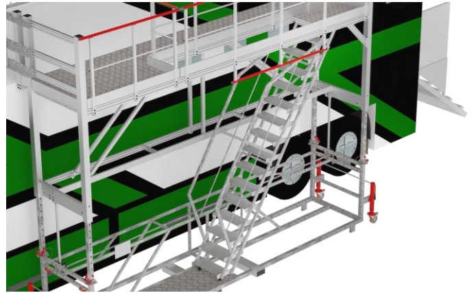
3D view of the access staircase