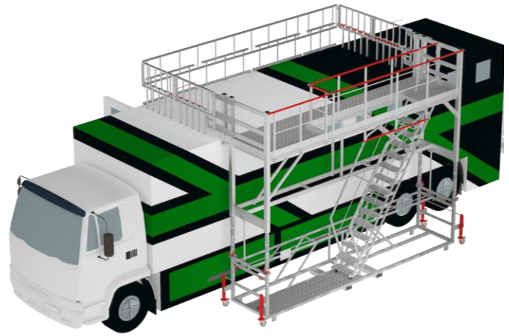
3D view of the structure with the ring deployed

Maintenance platform specifically designed for servicing vans , whether they are standard or customized for horse transport. With a sturdy and durable structure, the platform provides operators with safe and easy access .